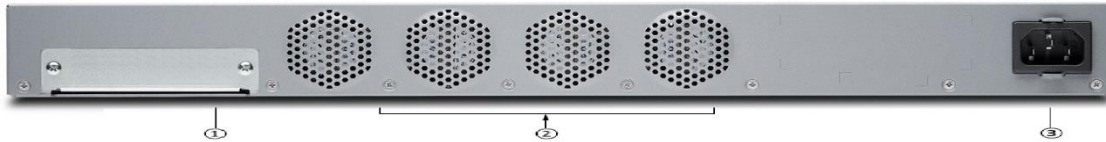
Figure 2 shows the rear panel of SRX340 Chassis.