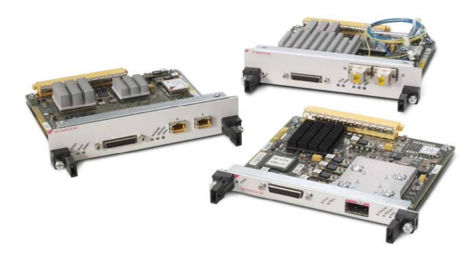
Figure 1. Cisco 1-Port OC-192 POS/RPR SPAs with XFP, VSR, and LR Optics

The Cisco<sup>®</sup> I-Flex approach combines shared port adapters (SPAs) and SPA interface processors (SIPs), providing an extensible design that enables service prioritization for data, voice, and video services. Enterprise and service provider customers can take advantage of improved slot economics resulting from modular port adapters that are interchangeable across Cisco routing platforms. The I-Flex design maximizes connectivity options and offers superior service intelligence through programmable interface processors that deliver line-rate performance. I-Flex enhances speed-to-service revenue and provides a rich set of quality of service (QoS) features for premium service delivery while effectively reducing the overall cost of ownership. This data sheet contains the specifications for the Cisco 1-Port OC-192c/STM-64c POS/RPR Shared Port Adapter (Cisco 1-Port OC-192 POS/RPR SPA; refer to Figure 1).