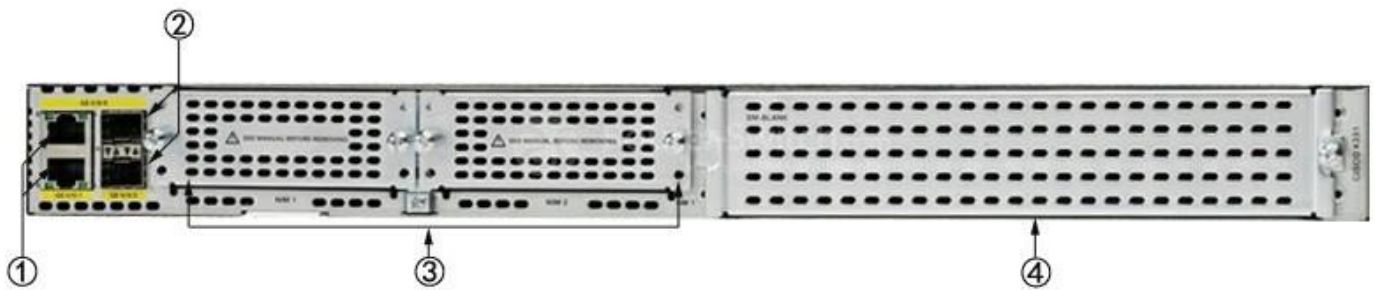
Figure 3 shows the back panel of Cisco ISR4331/K9.