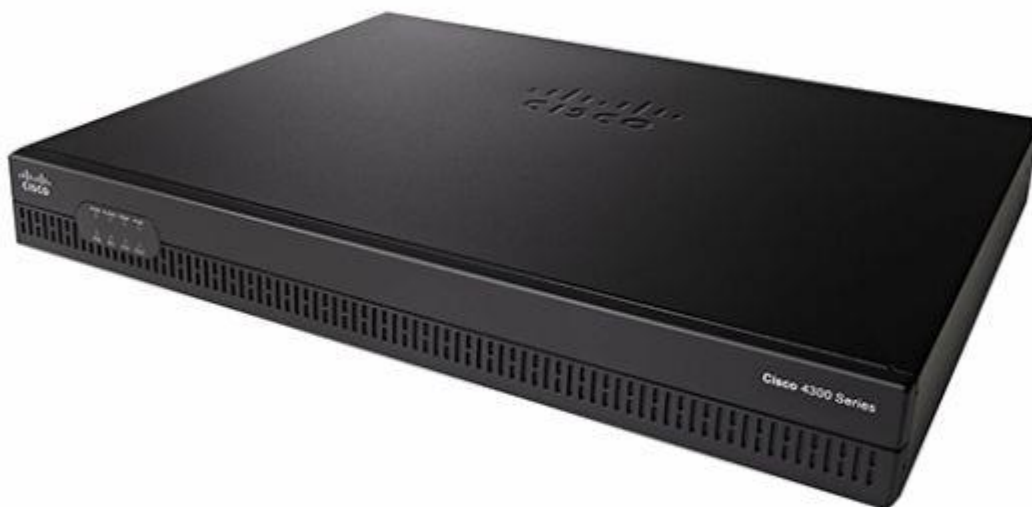
Table 1 shows the Quick Specs.

Figure 1 shows the appearance of Cisco ISR4321/K9 for reference. ISR4321-V/K9 is similar with it.