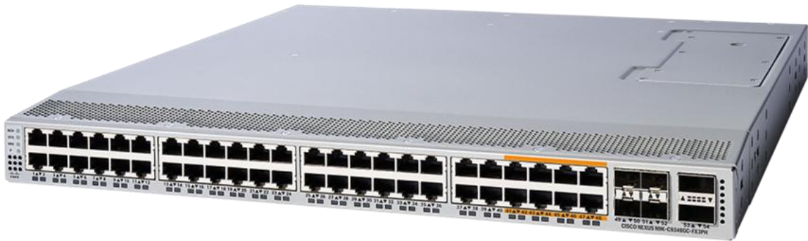
Figure 5. Cisco Nexus 9348GC-FX3PH Switch

The Cisco Nexus 9348GC-FX3PH Switch (Figure 5) is a 1RU switch that supports 696 Gbps of bandwidth and over 517 Mpps. The 40 1GBASE-T downlink ports on the 9348GC-FX3PH can be configured to work as 10-Mbps, 100-Mbps, or 1-Gbps ports. The last 8 downlink ports can be configured to work as 10-Mbps or 100-Mbps only. The 4 ports of SFP28 can be configured as 1/10/25-Gbps, and the 2 ports of QSFP28 can be configured as 40- and 100-Gbps ports, or a combination of 10, 25, 40, and 100-Gbps connectivity, offering flexible migration options. The last 8 ports are only half-duplex functionality and are limited to 10Mbps and 100Mbps speeds only. Supports power over ethernet. For details refer to Table 4.