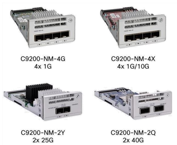
Figure 2. Cisco Catalyst 9200 Series Switch network modules

Cisco Catalyst 9200 Series switches come with modular or fixed uplinks as indicated in Table 1. With modular SKUs, the field-replaceable network modules provide infrastructure investment protection by allowing a nondisruptive migration from 1G to 10G and beyond. When you purchase the switch, you can choose from the network modules described in Table 3.