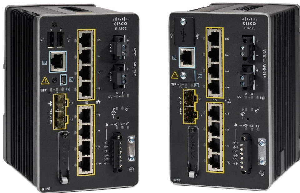
Figure 1. Cisco Catalyst IE3200 Rugged Series

The IE3200 series supports power budget of up to 240W for PoE/PoE+, shared across 8 ports, and is ideal for connecting PoE-powered end devices such as IP cameras, phones, wireless access points, sensors, and more.