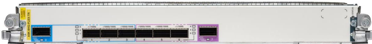
Figure 4. Cisco ASR 9000 Series 800G Packet Transport Combo Line Card - 5 th Generation - TR