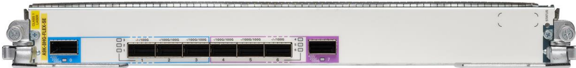
Figure 3. Cisco ASR 9000 Series 800G Service Edge Combo Line Card - 5 th Generation - SE