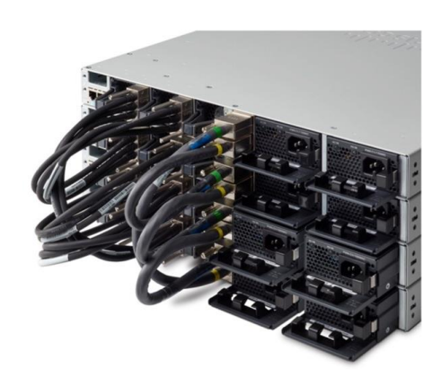
Figure 7. Cisco Catalyst 9300 Series StackPower