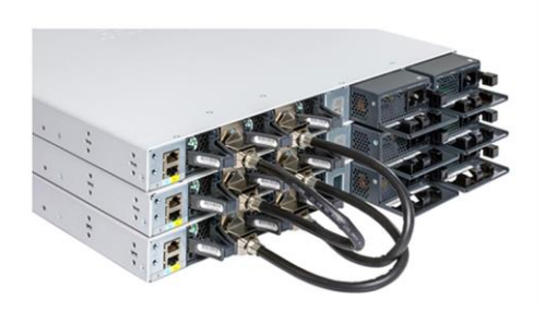
Figure 5. Cisco Catalyst 9300 Series modular uplink models stack (C9300/C9300X SKUs) and fixed uplink models stack (C9300L SKUs)

Table 5 lists the supported stacking options.