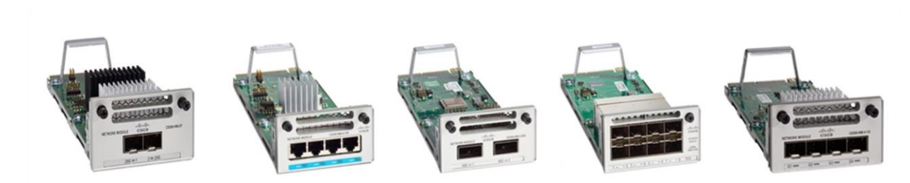
Figure 3. Cisco Catalyst 9300 Series Network Modules