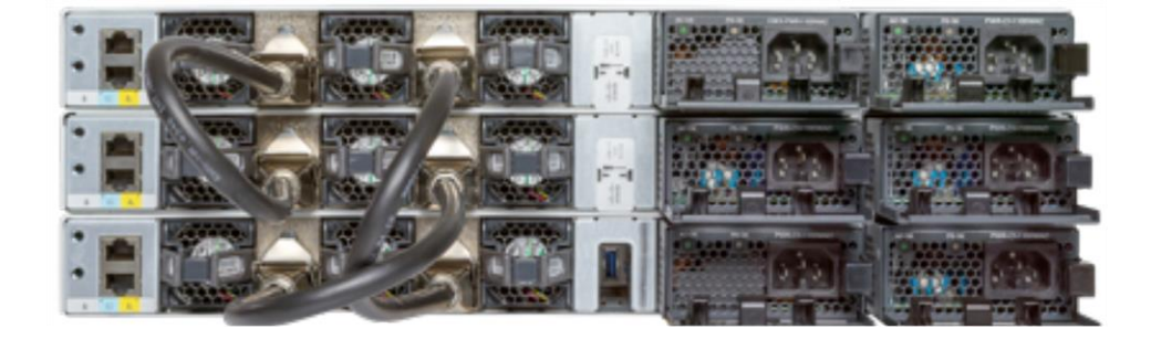
Figure 6. Cisco Catalyst 9300 Series fixed uplink models with optional stack kit