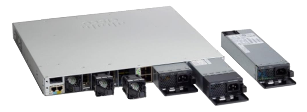
Figure 4. Cisco Catalyst 9300 Series Dual Redundant power supplies

Cisco Catalyst 9300 Series switches support dual redundant power supplies. The switches ship with one power supply by default, and the second power supply can be purchased when the switch is ordered or at a later time. If only one power supply is installed, it should always be in power supply bay #1. The switches also ship with three field-replaceable fans. Power Supplies are common across the Catalyst 9300 Series.