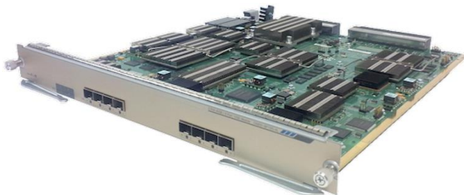
Figure 3. 6800 Series 8-Port 10-Gigabit Ethernet Fiber Module

The C6800 Family 8-port 10-Gigabit Ethernet Fiber module provides up to 40 10-Gigabit Ethernet fiber ports in a single Cisco Catalyst 6807-XL Switch chassis, or up to 80 10-Gigabit Ethernet fiber ports in a Cisco Catalyst 6807-XL Virtual Switching System (VSS) 2T. It also provides up to 88 10-Gigabit Ethernet fiber ports in a single Cisco Catalyst 6513-E Switch chassis or up to 176 10-Gigabit Ethernet fiber ports in a Cisco Catalyst 6500 Virtual Switching System (VSS) 2T.